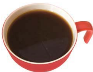
Freeze Concentrated Liquid Coffee