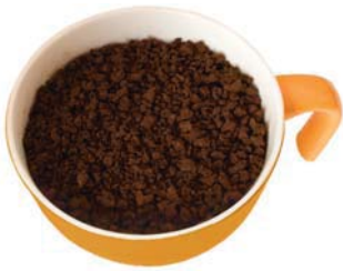
Agglomerated / Granulated coffee