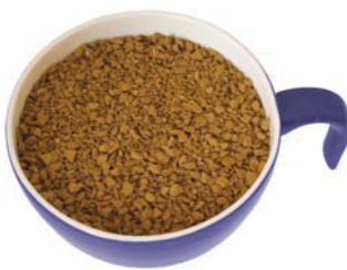
Freeze Dried Coffee