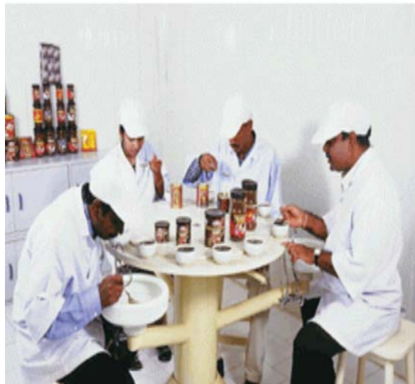
Quality Control laboratory at Duggirala, India

CCL Products has continuously strived to compete in the global market and apart from meeting the international standards, has surpassed the same in various respects. CCL Products has invested and continues to invest substantial amounts in Research and Development, not only to improve the quality of its coffee products, but also to develop its products to meet the individualized tastes and preferences of its customers across various International markets.