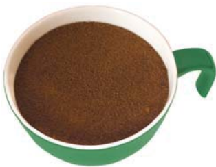
Spray Dried Coffee

CCL Products is engaged in the manufacture of soluble instant coffee, including Spray Dried Coffee, Agglomerated/ Granulated coffee, Freeze Dried Coffee, as well as Freeze Dried Coffee.