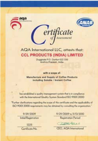
ISO 9001 : 2000

CCL Products’ Coffee Manufacturing Plant also holds Kosher and Halal Certification.