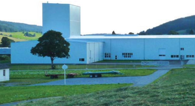
Agglomeration and Packing facility in Switzerland

CCL Products has recently set up an Agglomeration and Packing facility in its Plant situated in Switzerland, through its wholly owned subsidiary, Grandsaugreen S.A., with latest technology, having a present production capacity of 3,000 MTs per annum. This enables CCL Products to cater to the European market with short lead time.